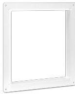
QE-FBA Code 24183